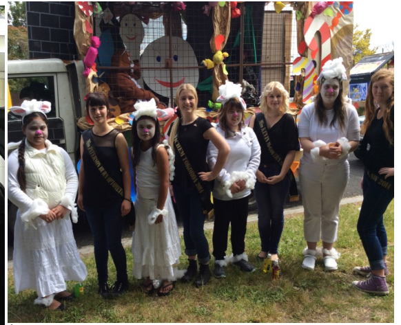
Above Caption 2