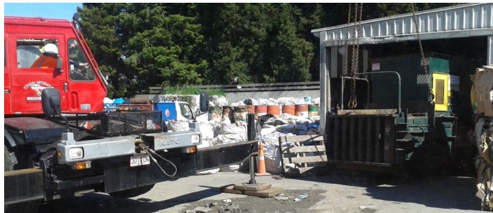
Above: The Main Baler being removed from the shed for its trip to Croad Place!