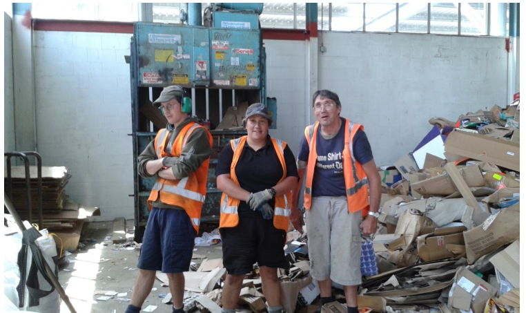
Above: Some of the workers enjoying their new working site! These three workers load the cardboard baler (behind them) They would like to wish every one a Merry Xmas and Happy New Year!

CROAD PLACE. The recycling crew from Thompson Street are enjoying the new site and will be working inside under cover most of the time as there is enough room for the main baler as well as the smaller cardboard baler. There is a sorting table for sorting cans and bottles as well.