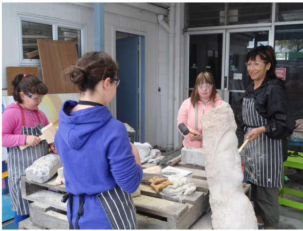
Above: Caption 1 Sculpturing Programme

Caption 1. 'Creative New Zealand funding provided inclusive sculpture programmes for our community. Very successful outcome with students booked in for next year.