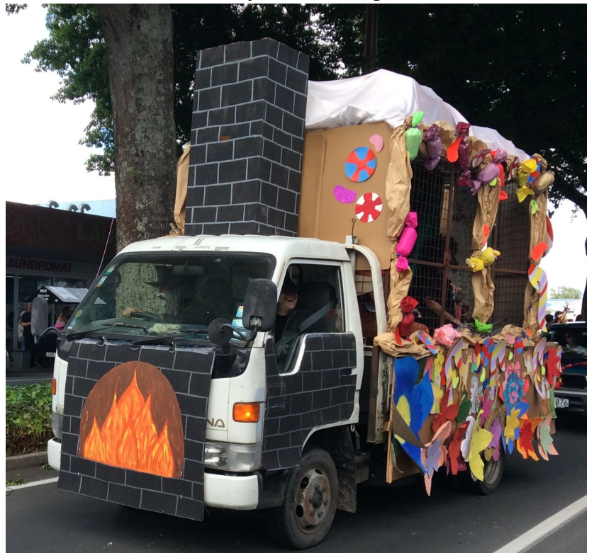
Above Caption 3: