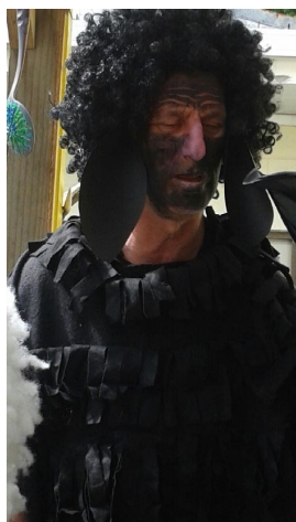
Above: Baa Baa Black Sheep!