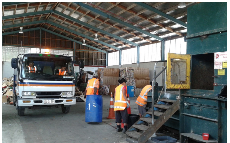
Below: The Baler installed and working at Croad Place.

Below: One of our trucks off-loading cardboard inside the main shed. The trucks can now enter the building, off-load and leave out the exit doors.