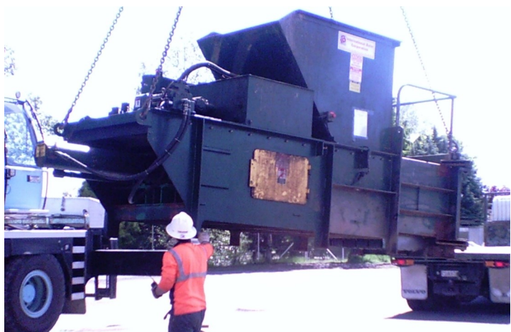
Below: After a bit of maintenance at 'SWPE' the baler is finally at Croad ready to be installed in its new home!