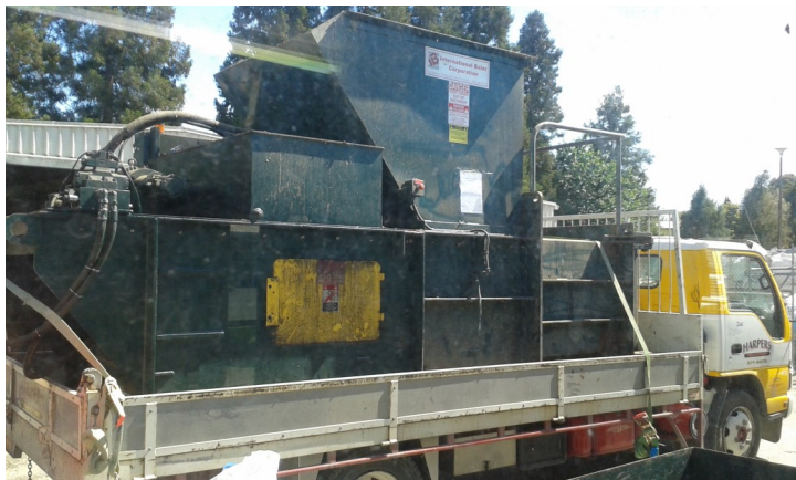
Above: The Baler on the truck heading for its new home at Croad Place!