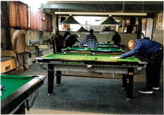
Photo 3. The increase in our groups attending the 'Cossie Club's pool session has produced some competitive players.

CREATIVE ART building on Bridge St - has a fresh look with the newly painted exterior.