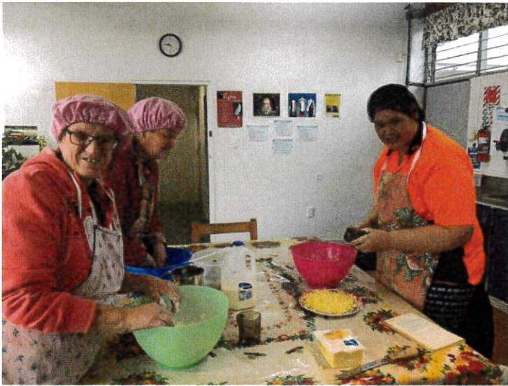
Photo 1. Cooking lunch