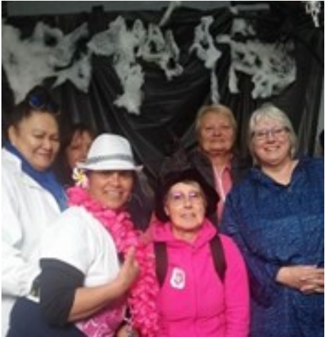
Left: SWPIC and Sports Waikato ladies, dressed up and ready to get scared! Other visitors ‘Brett’ & YMCA staff and some of our crew.