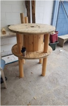
Above: Bar leaner for a community order.