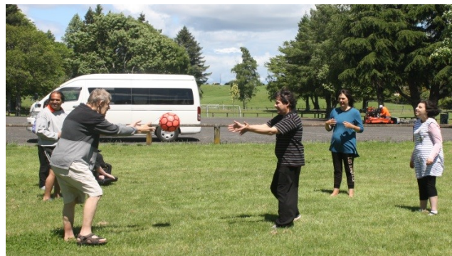
Photo right: All staff and clients are learning to sign. It's lots of fun and all are enjoying it, this helps with communication with one of our clients who already knows how to sign in her everyday life. Photo Below: It's great to see the weather improving so all can enjoy getting out in the fresh air for a bit of fun and exercise.