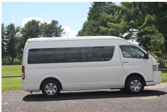
C.H.O.I.C.E.S new Van!!!