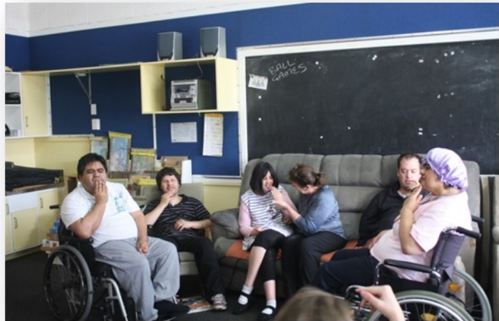
Clients learning to sign!