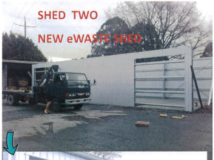
NEW eWASTE SHED